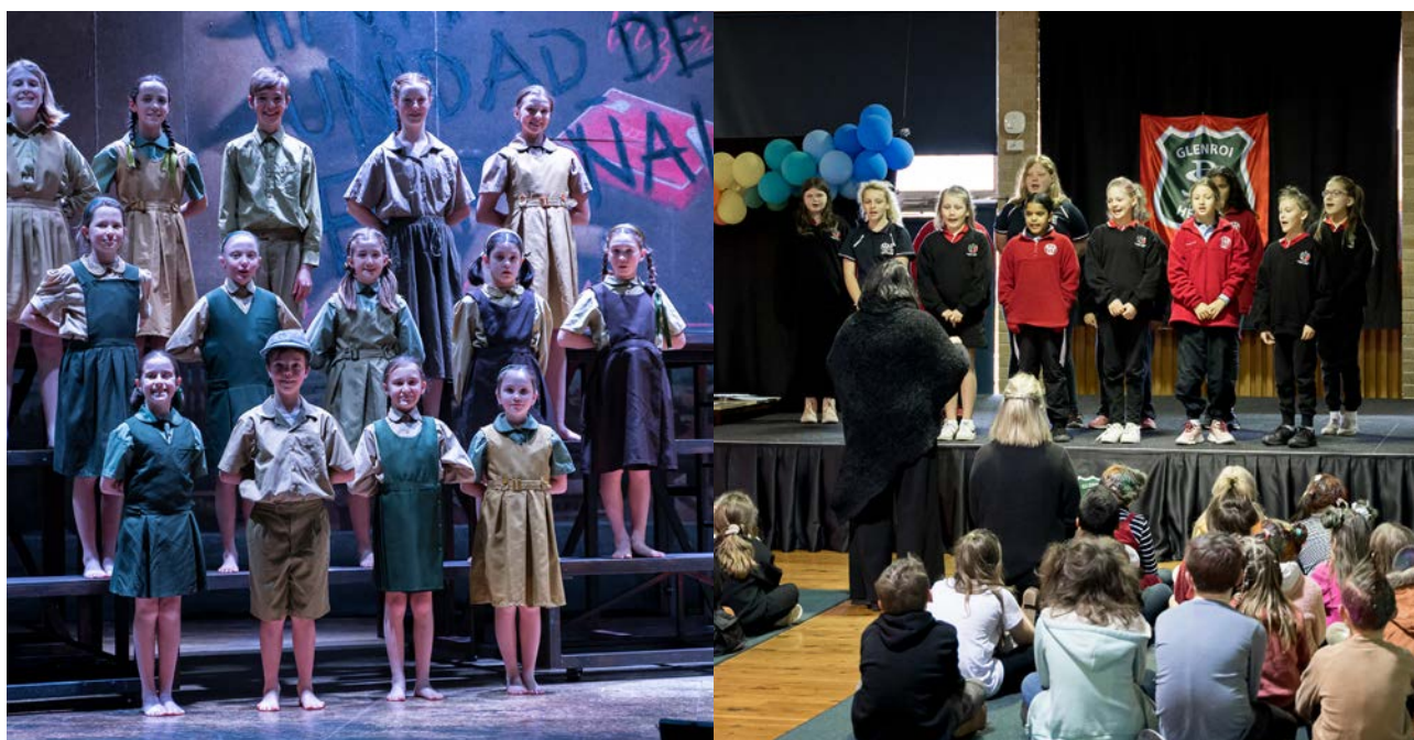
Left Image: Opera Australia 'Carmen' Children's Chorus | Right Image: Wula Gurray choir perform at Glenroi Heights Public School.

The greatest gift came at the end of 2021 in the form of our successful application to Create NSW Creative Capital Infrastructure Grants program for $250,000 being for the purchase of a Steinway C-227 Grand Piano for the new Conservatorium Recital Hall. Minister Don Harwin visited to announce the successful application.