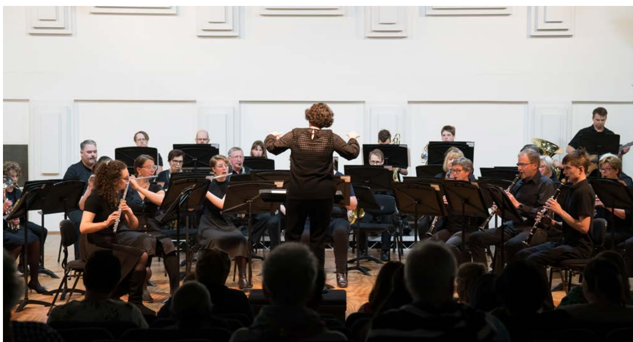
Symphonic Wind Ensemble