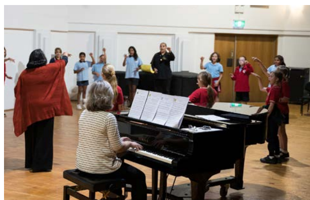
Wula Gurray (Voice of Change) choir in rehearsal

Other performances included the ORC ensemble and soloists at Carols by Candlelight, ORC staff lockdown videos, Breaking the Silence Orange.