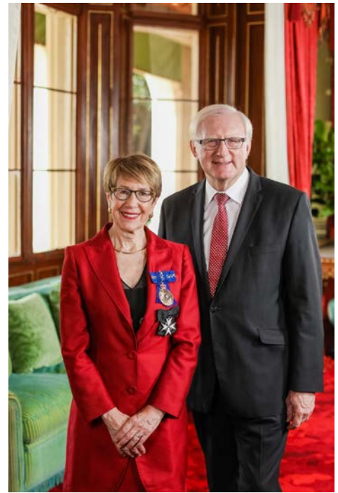
ANSWRC Patron Her Excellency the Honourable Margaret Beazley, Governor of NSW