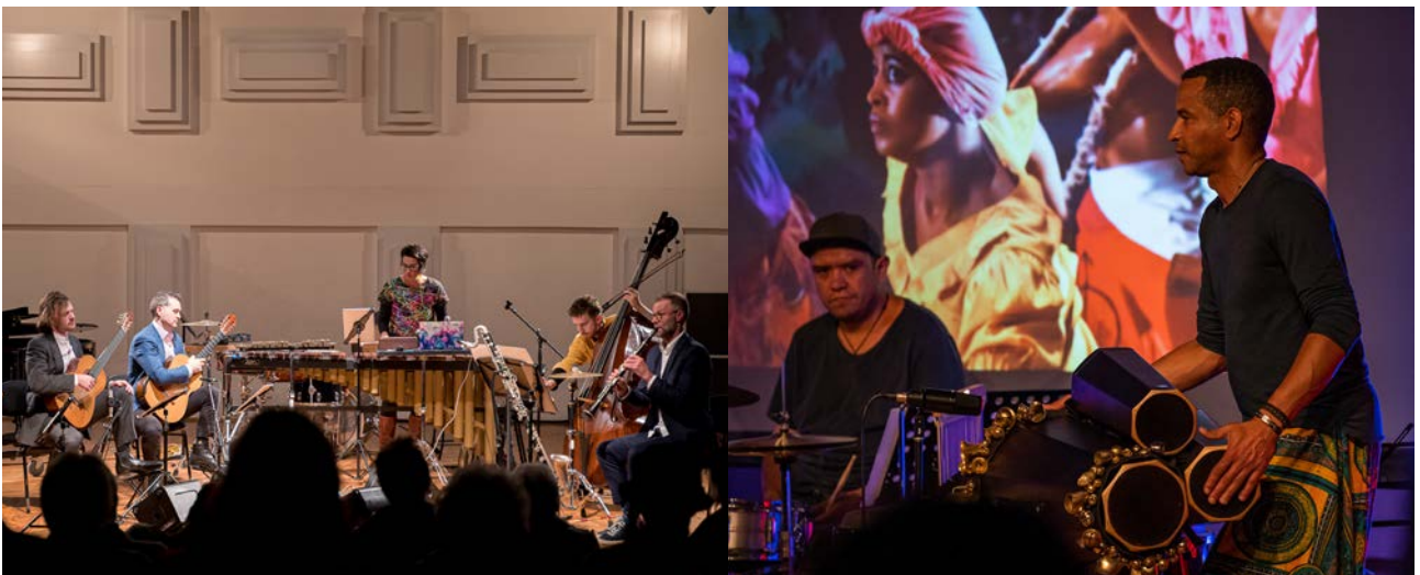
Left Image: Ensemble Offspring | Right Image: Caribe