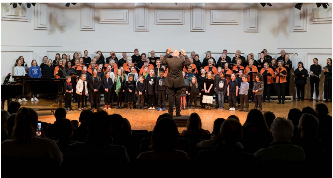
Choral Gala combined choirs